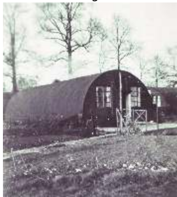
Pictured: one of the Nissen huts at Blake Hill Farm

Profits from all CR book sales are donated to Cricklade Open Door.